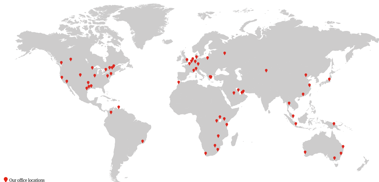
◆ Our office locations

Norton Rose Fulbright is a global law firm. We provide the world's preeminent corporations and financial institutions with a full business law service. We employ 3500 lawyers and other legal staff based in more than 50 cities across Europe, the United States, Canada, Latin America, Asia, Australia, Africa, the Middle East and Central Asia.