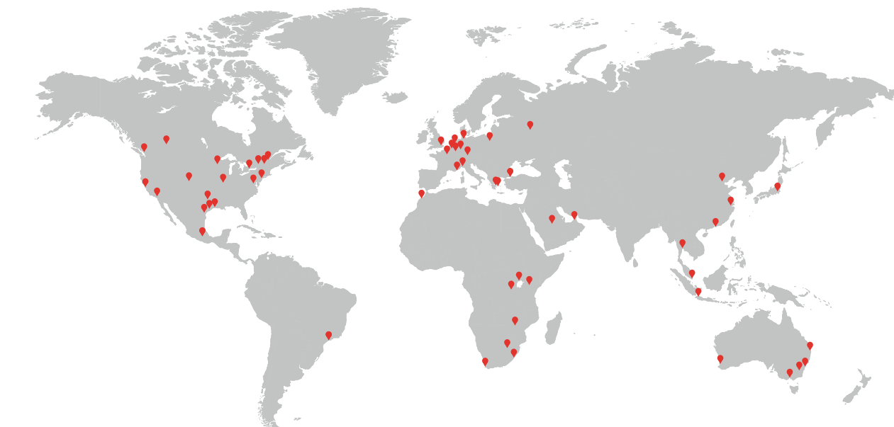
Our office locations

Norton Rose Fulbright is a global law firm. We provide the world's preeminent corporations and financial institutions with a full business law service. We have more than 3700 lawyers and other legal staff based in Europe, the United States, Canada, Latin America, Asia, Australia, Africa and the Middle East.