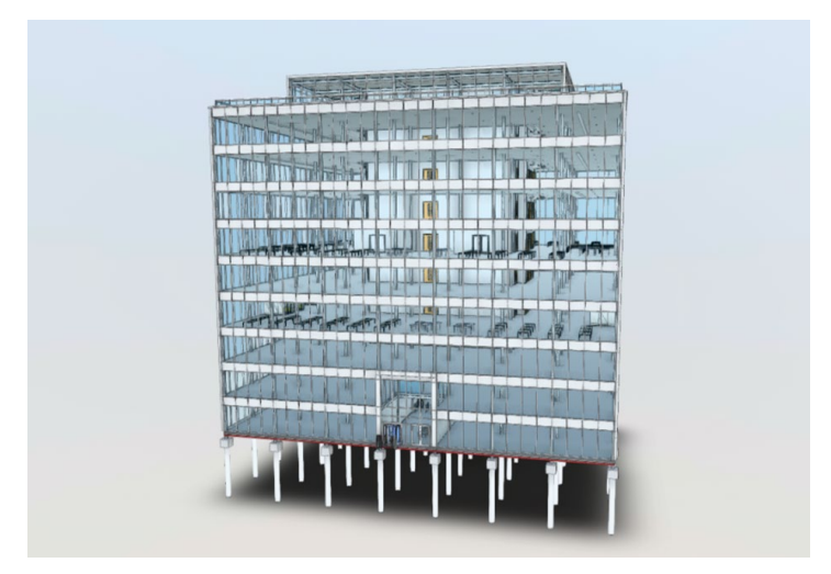
Figure 1 External view of building information model (created by HKA)

After designers and project stakeholders have created digital representations of built assets they can share and combine the models. Users are able to view and interact with the design information. Building information models act as digital rehearsals of construction, which helps manage project risk. If designs are coordinated, it reduces the risk of delay.